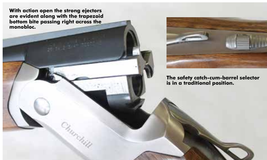
With action open the strong ejectors are evident along with the trapezoid bottom bite passing right across the monobloc.