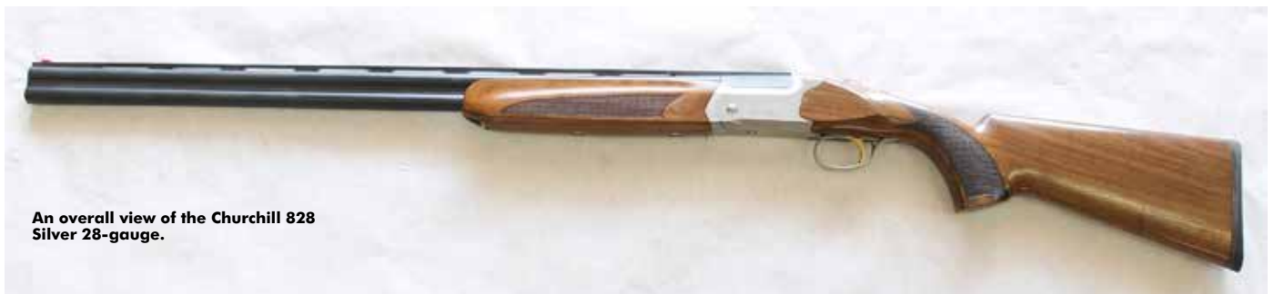
An overall view of the Churchill 828 Silver 28-gauge.

At the muzzle end the Churchill 828 Silver has a barrel fluoro front sight and is fitted with internal choke tubes, five supplied and all packed into a handy plastic case along with the propeller-type spanner. Slots in the ends of the choke tubes immediately identified the choke constriction but these should only be checked or installed