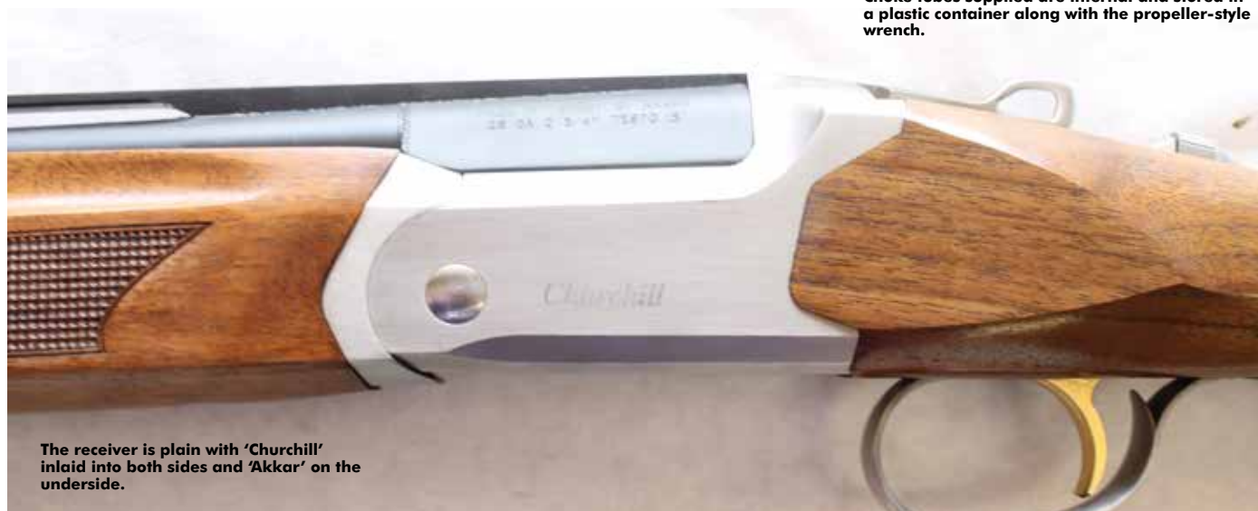
The receiver is plain with 'Churchill' inlaid into both sides and 'Akkar' on the underside.