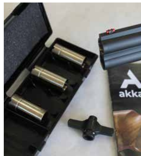
Choke tubes supplied are internal and stored in a plastic container along with the propeller-style wrench.

Operating the top lever became something of a skill as the new gun was pretty