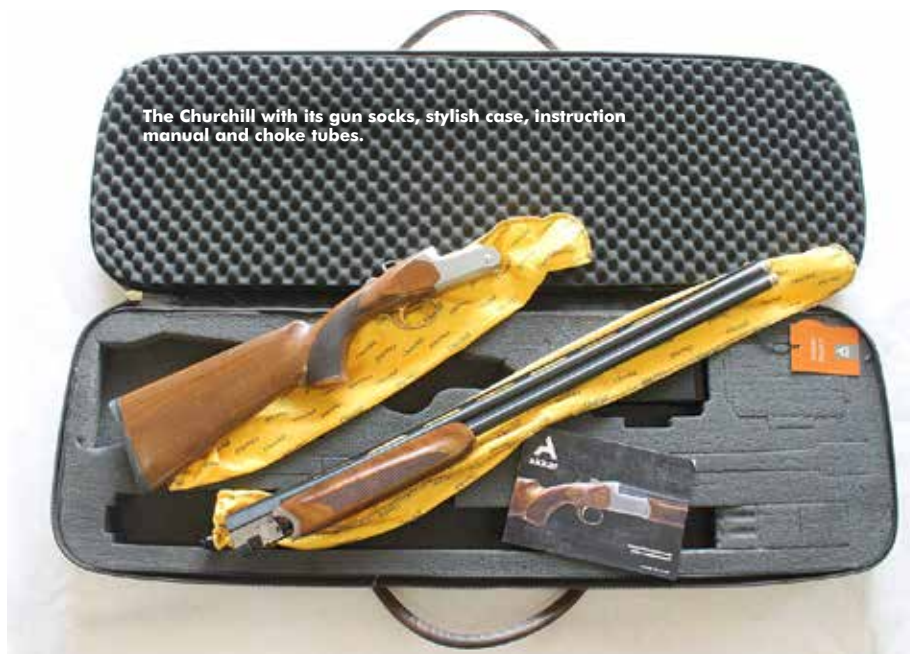
The Churchill with its gun socks, stylish case, instruction manual and choke tubes.

Warrantied for five years, distributor Nioa has backed the gun's reliability and service, the five-year guarantee something usually reserved for more expensive shotguns as